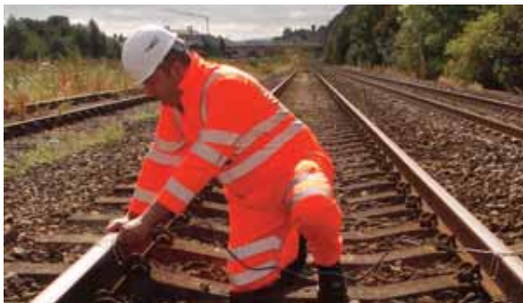
Using a track-circuit operating clip

A track-circuit operating clip must be used only once.