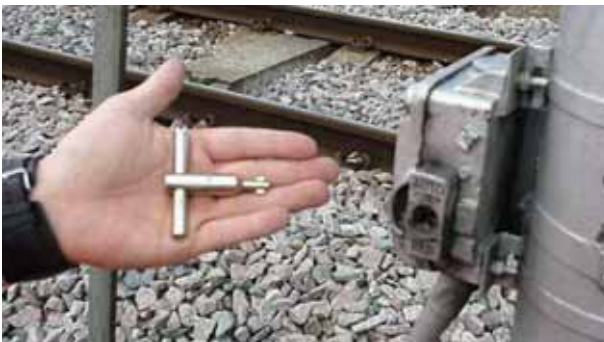
Signal-post replacement key and switch

Although called a SPRS, they are not always on the signal post but will be near to the signal and may be on a separate post.