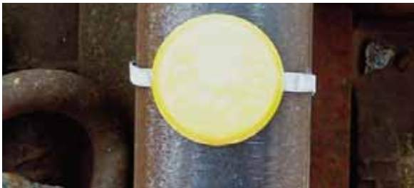
Detonator secured to rail

If you have to place detonators on the line when not at a signal and you are to stay near the detonators, you must stand at least 30 metres (approximately 30 yards) beyond the detonators so that the train driver will see your handsignal after exploding the detonators.